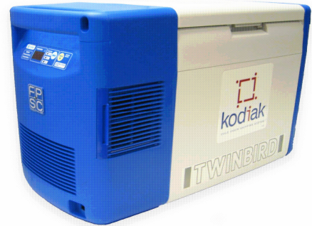
Control Panel AC25

The result is a leading-edge container that you can trust to manage your portable cool and frozen goods transportation.