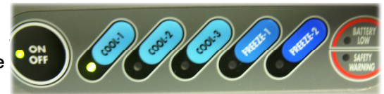
Control Panel BV25